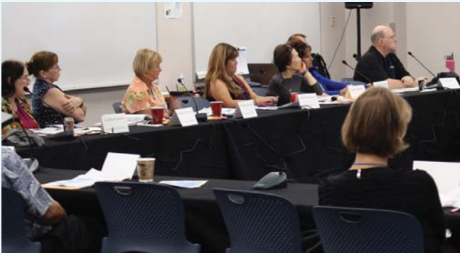
The Stakeholder Advisory Group is made up of leaders of the community who represent diverse interests.