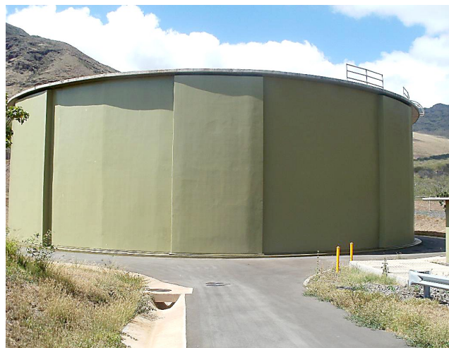
Reservoir Construction. The newly constructed Nanakuli 242 reservoir adds two million gallons of potable water storage capacity for the Leeward water system.