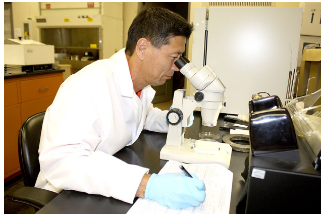
Ensuring Water Quality. Board of Water Supply chemists and microbiologists understand the importance of their roles in providing safe drinking water to Oahu residents. Each year they conduct thousands of water quality tests and learn state-of-the-art techniques and procedures.