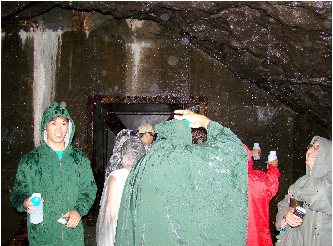
Pookela Internship Program. Interns learned about the BWS and where Oahu's water comes from during a tour of Waihee Tunnel.