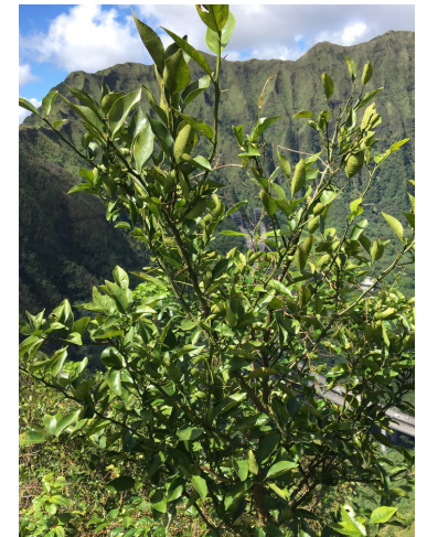
Introduced Citrus Trees