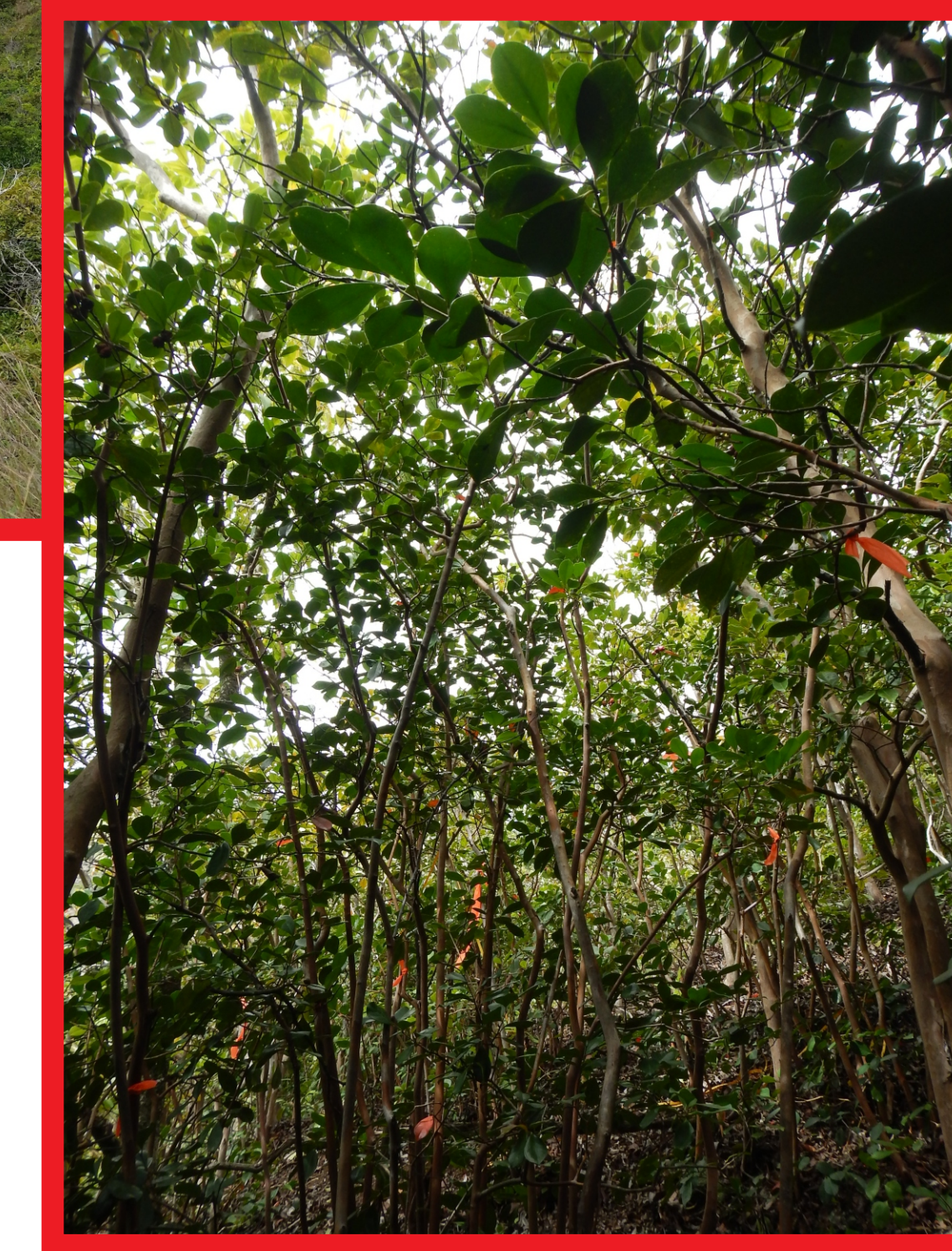
Strawberry guava on test plot, prior to “topping”