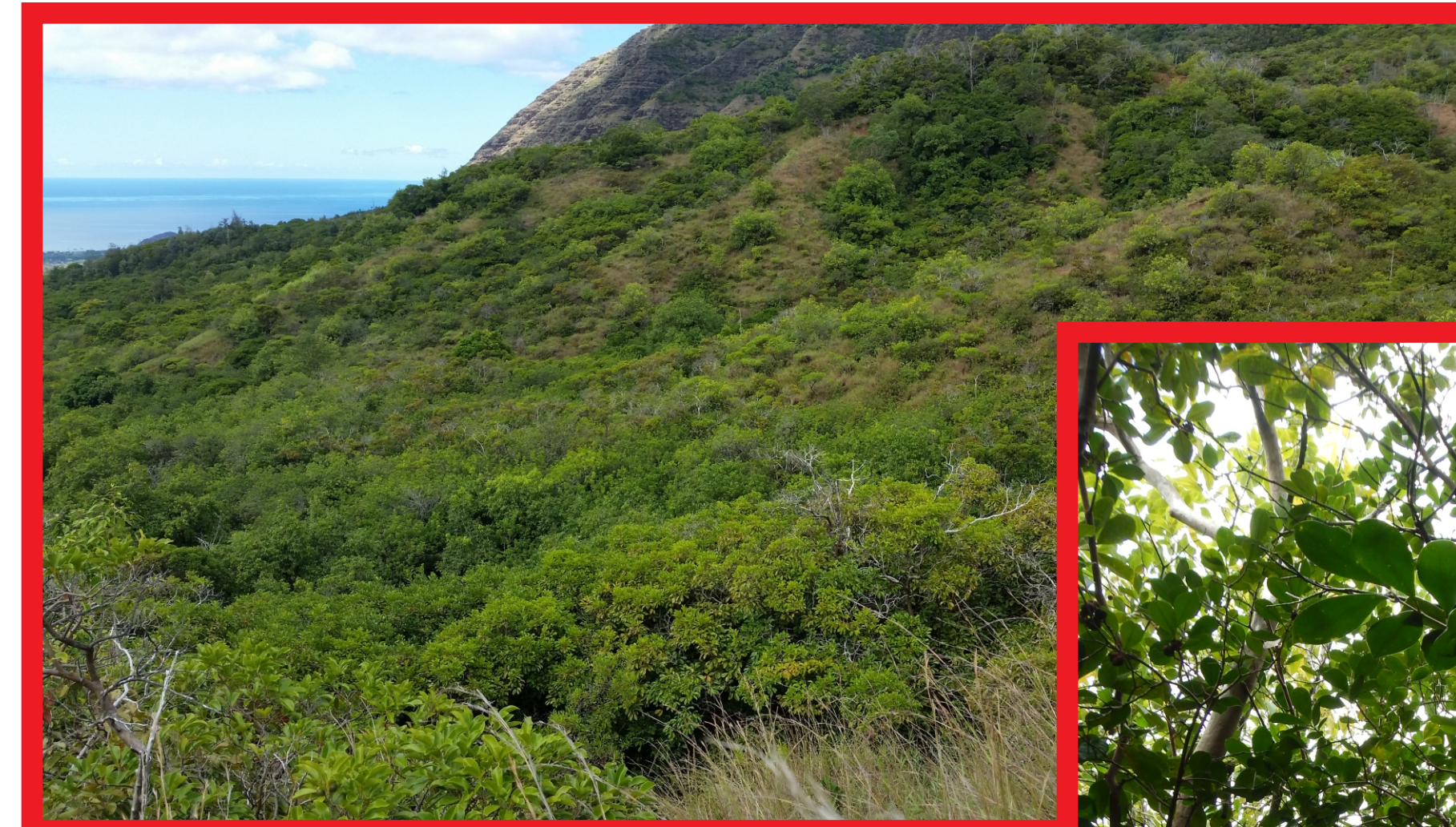
Test plot location, Mākaha Valley

Based on this successful introduction of T. ovatus across Hawai`i, and with the support of the State of Hawai`i Department of Land and Natural Resources (DLNR), BWS initiated a T. ovatus release in test plots on BWS watershed land. As strawberry guava has been overtaking much of the BWS watershed land in Mākaha, two 20 ft x 20 ft test plots were sited in this region, along a southwest-facing ridge in the back of the valley.