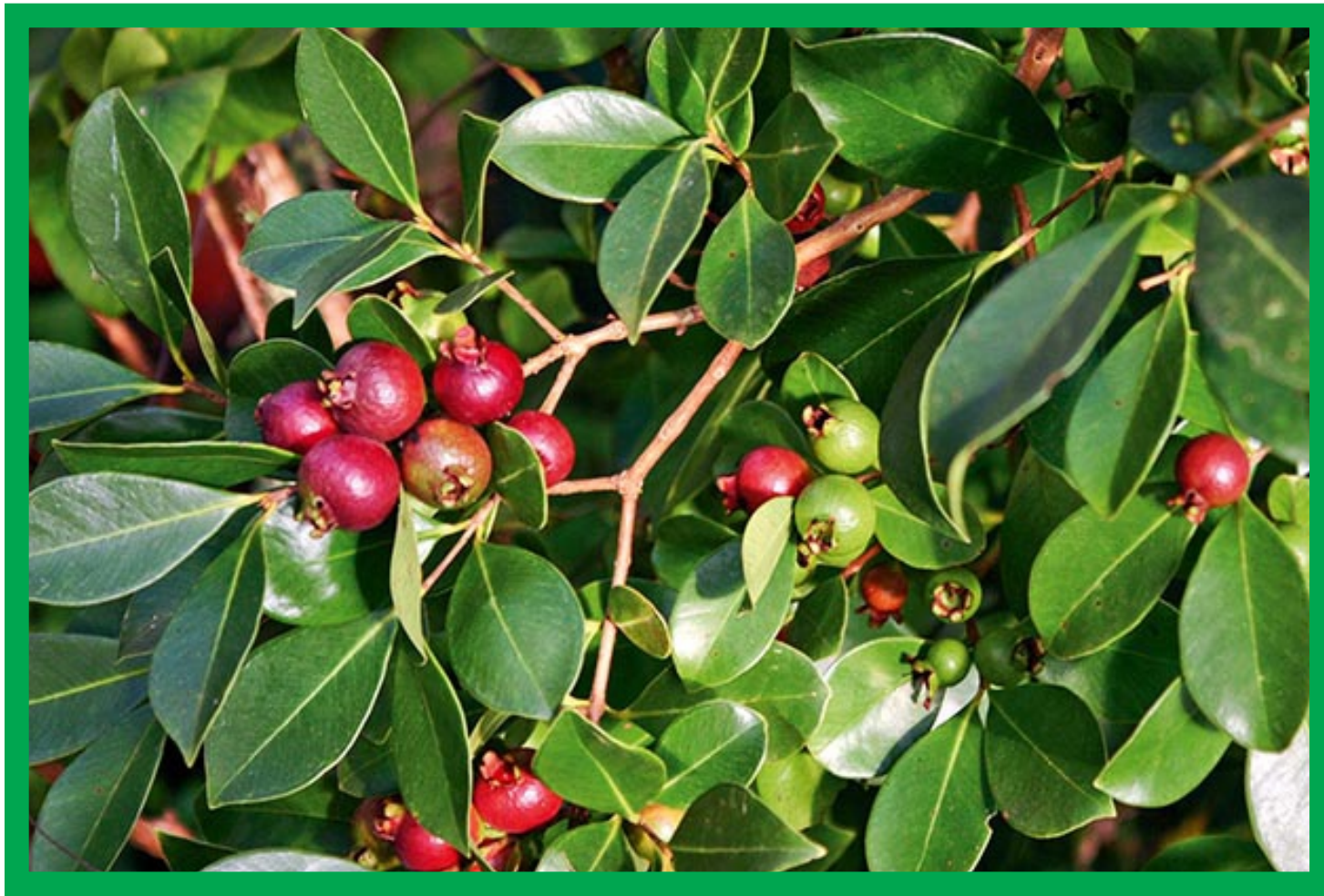
Strawberry guava ( Psidium cattleianum )

The Honolulu Board of Water Supply (BWS) Watershed Program works to ensure an adequate supply of fresh water for current and future generations, by protecting the ability of O`ahu's watersheds to capture and store rainfall in the aquifers below. This ability is critical, as rainfall is the sole natural source of fresh water supply for the island.