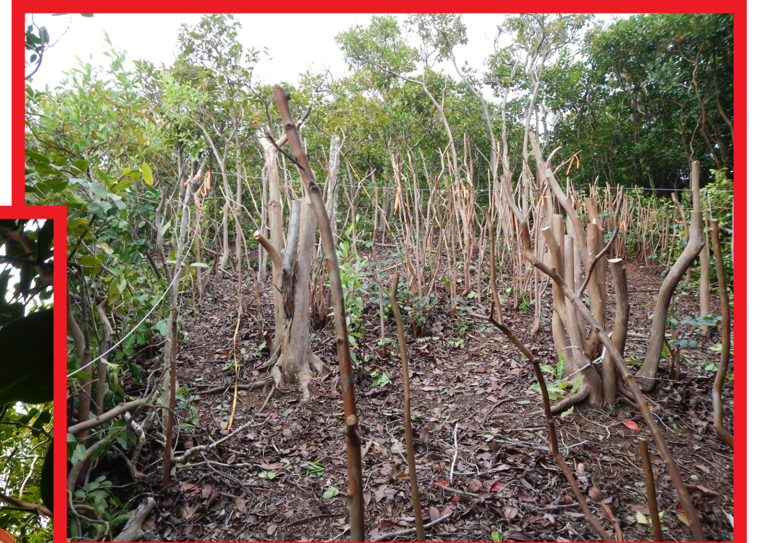
Strawberry guava on test plot, after “topping”

Drawing from methods used successfully in the previous T. ovatus releases in Hawai`i, the test plots were prepared by “topping” the existing strawberry guava, waiting until the new leaves began to “flush”, then planting several young strawberry guava already inoculated with T. ovatus throughout the plots. The test plots were prepared in late 2017, and inoculated in early 2018.