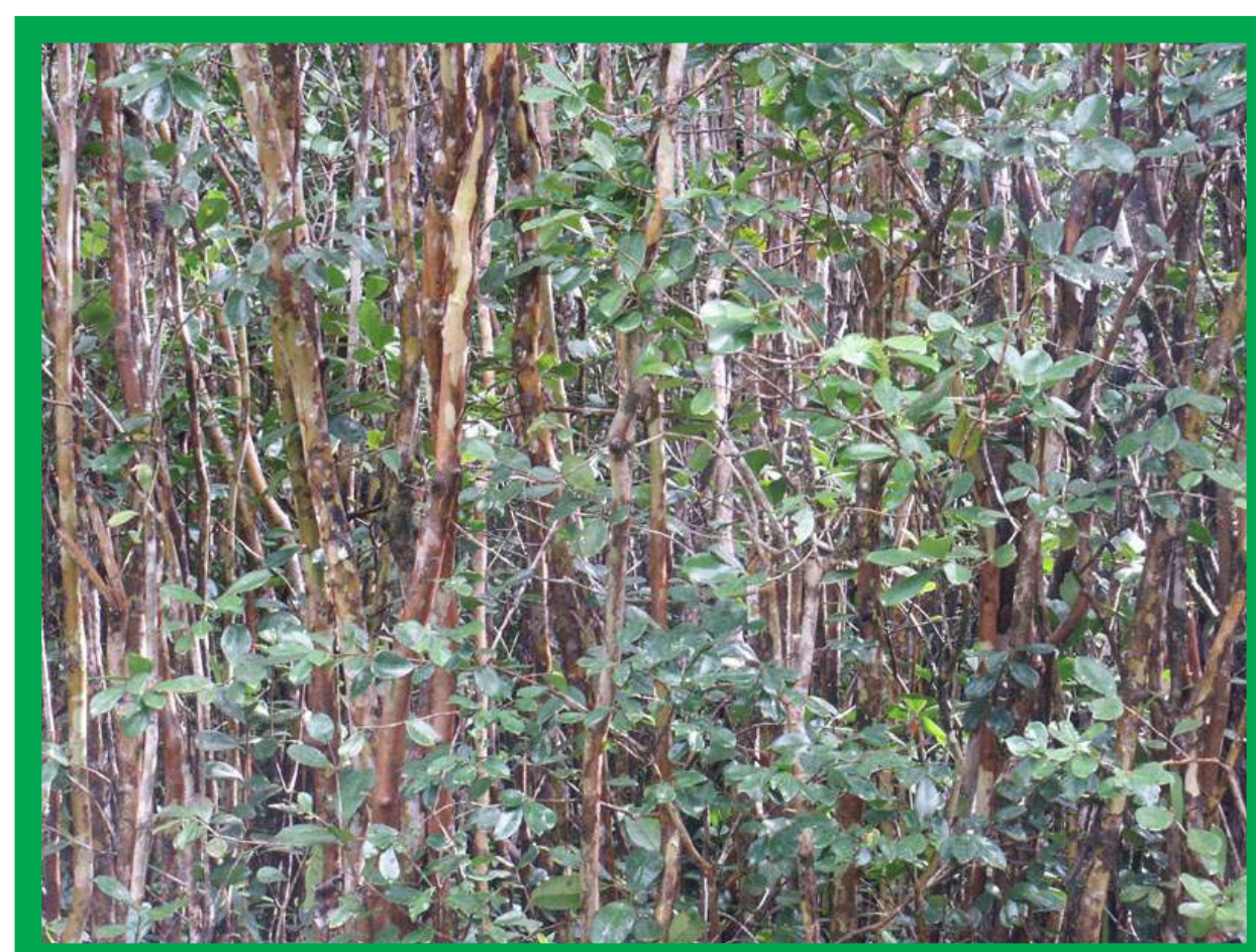
Typical dense stand of strawberry guava

Strawberry guava ( Psidium cattleianum ) is considered to be one of the most destructive invasive plant species in Hawai`i. This species was brought to Hawai`i in 1825 for its fruit and ornamental attributes. Due to a lack of natural predators and diseases in Hawai`i compared to its native Brazil, the plant has spread rapidly across the islands via both shoots and seeds, replacing many hundreds of thousands of acres of native forest with monotypic stands of the plant. For native forest replaced by strawberry guava, the rainfall lost to groundwater recharge due to this plant, is thought to be around 25 percent of total rainfall.