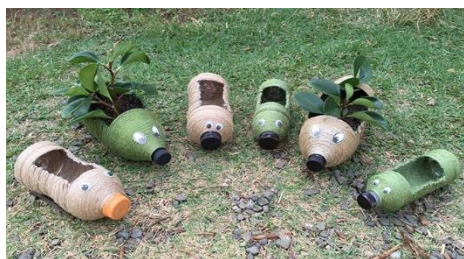
Luke and Cheryl Takayama made a whole family of "Xeric Critters" after their workshop at Halawa Xeriscape

I want to feature the following members and thank them for sharing their 2015-2016 workshop skills put to test! Their success encourages the rest of us to do the same! Happy 2017!