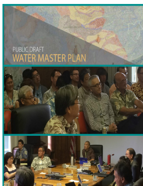
Participants at the October 2016 BWS Board meeting when the Water Master Plan was adopted.

The Board of Water Supply (BWS) Board of Directors adopted the BWS's long-term Water Master Plan at its October 2016 meeting. This ensures that the plan will serve as an official policy for the BWS as it continues to provide Oahu residents with safe, dependable, and affordable water now and into the next generation.