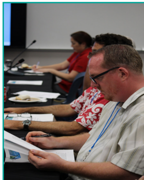
SAG members review BWS financial policies as a first step towards developing the long-term financial plan.

Follow the SAG's activities through meeting notes available on the BWS website at http://www.boardofwatersupply.com/water-resources/water-master-plan/stakeholder-advisory-group .