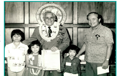
From our files: At the 1987 mayoral proclamation ceremony, then-Mayor Frank Fasi poses with then-BWS Manager Kazu Hayashida and a few of that year's Water Conservation Week poster contest participants.

The Board of Water Supply (BWS) recognizes that same week as Water Conservation Week. Since 1979, the Mayor of the City and County of Honolulu has proclaimed the first full week in May as Water Conservation Week on Oahu. Oahu students Grades K-12 across the island help the BWS spread the important message of conserving our island's precious groundwater through creative entries in an annual poster and poetry contests for this observance.