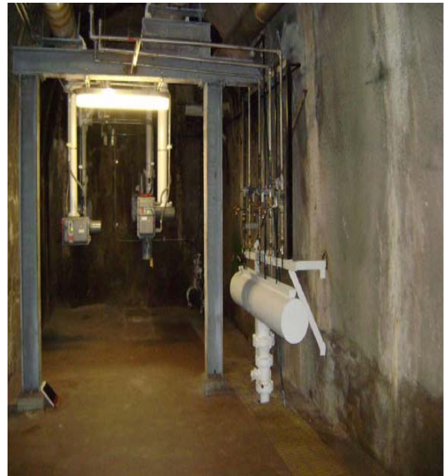
Figure 3: Typical Tank Top Access