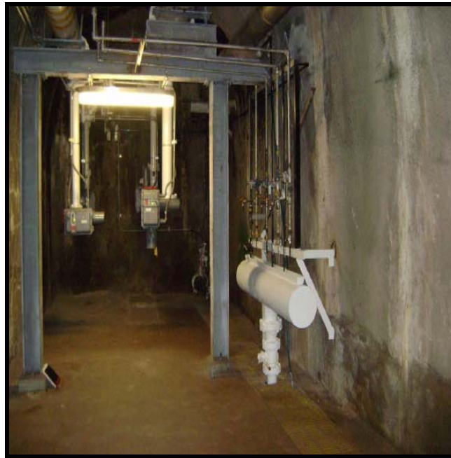
Figure 1-2: Typical Tank Bottom Access