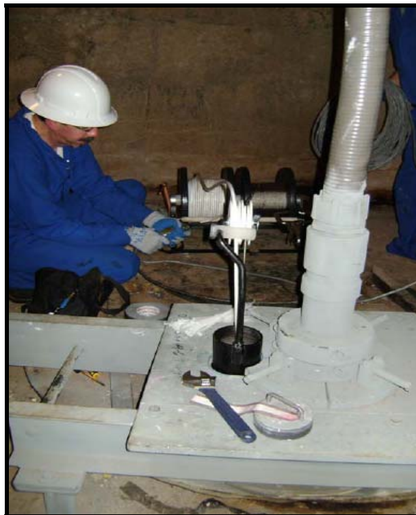
Figure 1-3: Typical Tank Top Access