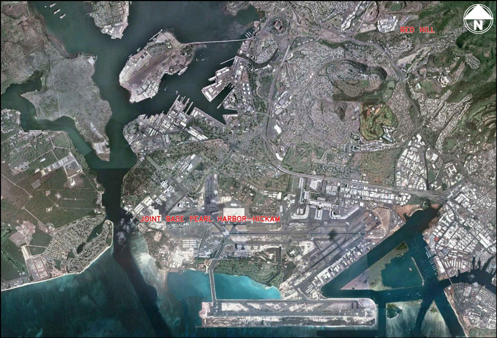
Figure 1-1: Base Overview Map

SCALE: NOT TO SCALE DATE: FEBRUARY 2013 S.O. NO.: 127964 FILE: 127964_RH DSN/DWN: WRH CHK: MC